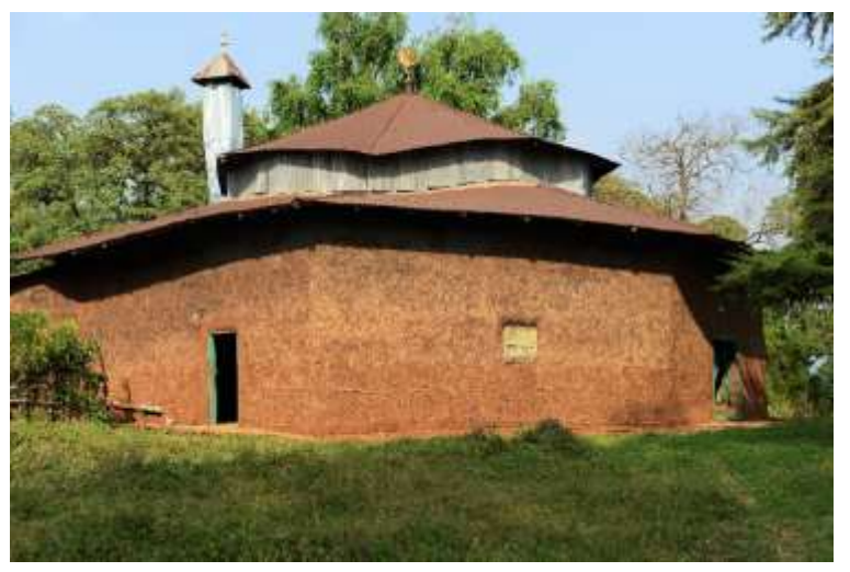
Figure 3 Limmu Gannat Mosque.