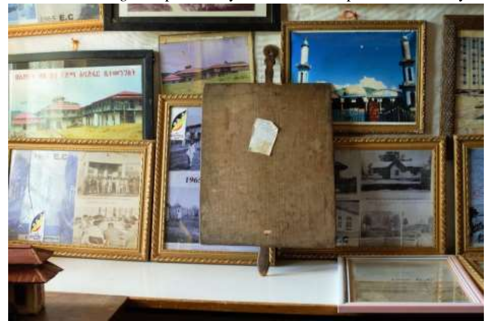
Figure 1 Lawh, Jimma Museum.

The Islamization of the Gibe region followed a path that involved merchants coming from East (Harar, Yemen) and West (Sudan, Bornu).<sup>6</sup> The Abba Mecha Oromo who moved in these areas at the beginning of the 18<sup>th</sup> century mixed with the local Sidama population through marriages and affiliation.<sup>7</sup> This can be considered as one of the reasons behind the abandonment of the traditional gadaa political system and the adoption of monarchy. The majority of people of